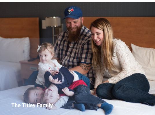
The Titley Family