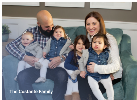
The Costante Family