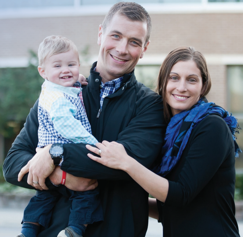
The Lane Family