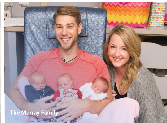
The Murray Family